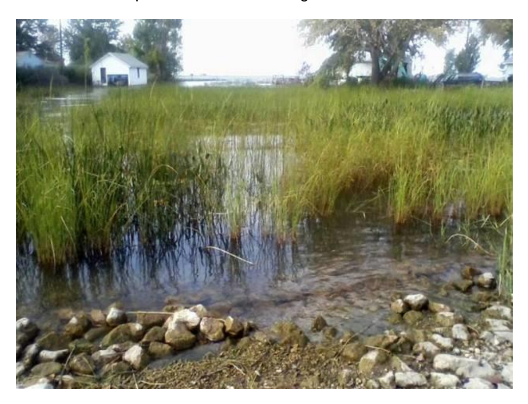
Wild-rice appears to be increasing all over Harsens Island, like this patch only about 15 feet north of South Channel Drive.