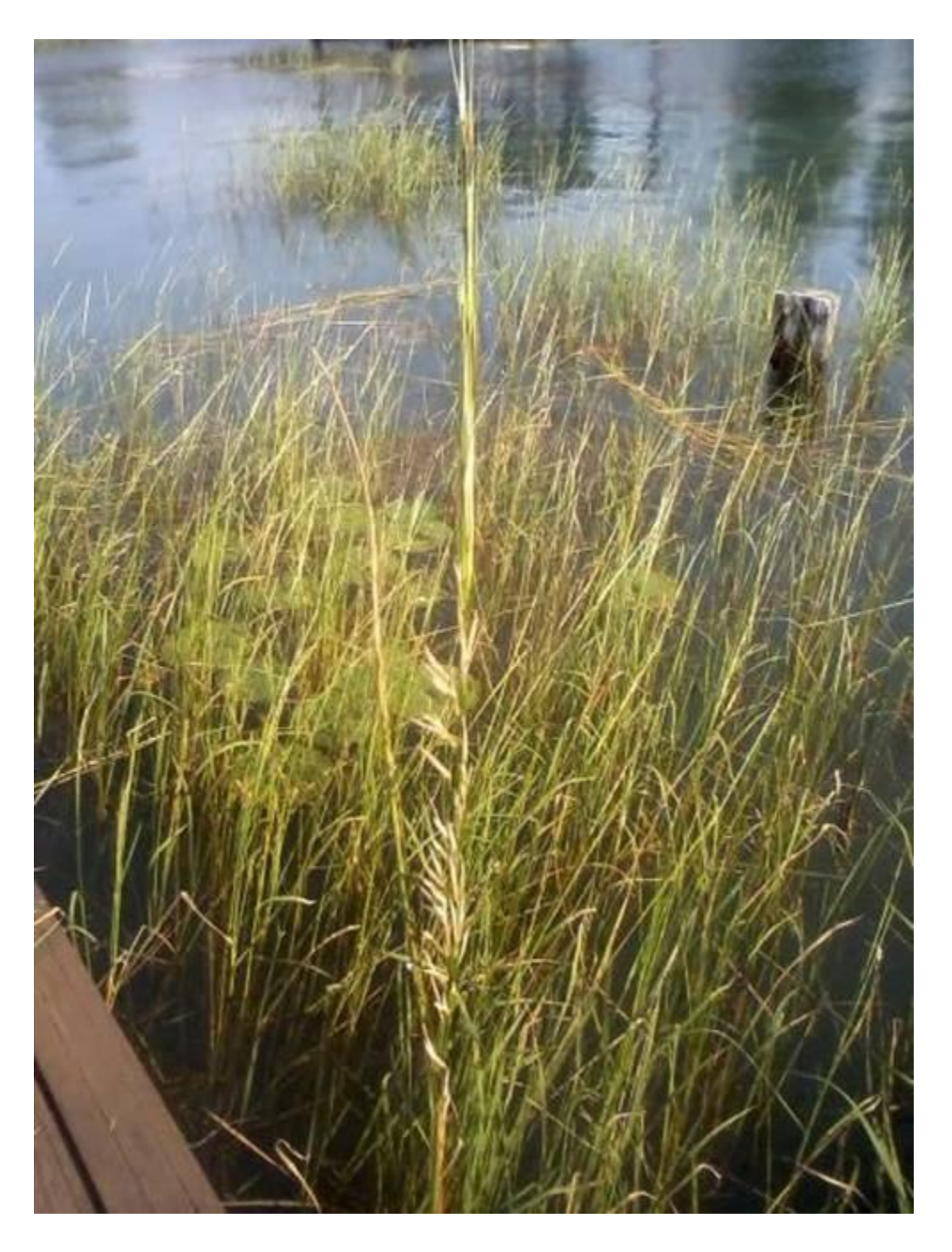
A wild-rice plant showing seeds tight against the stalk above and pendant male flowers below. In the background is a patch of wild-rice in varied stages of seed development.