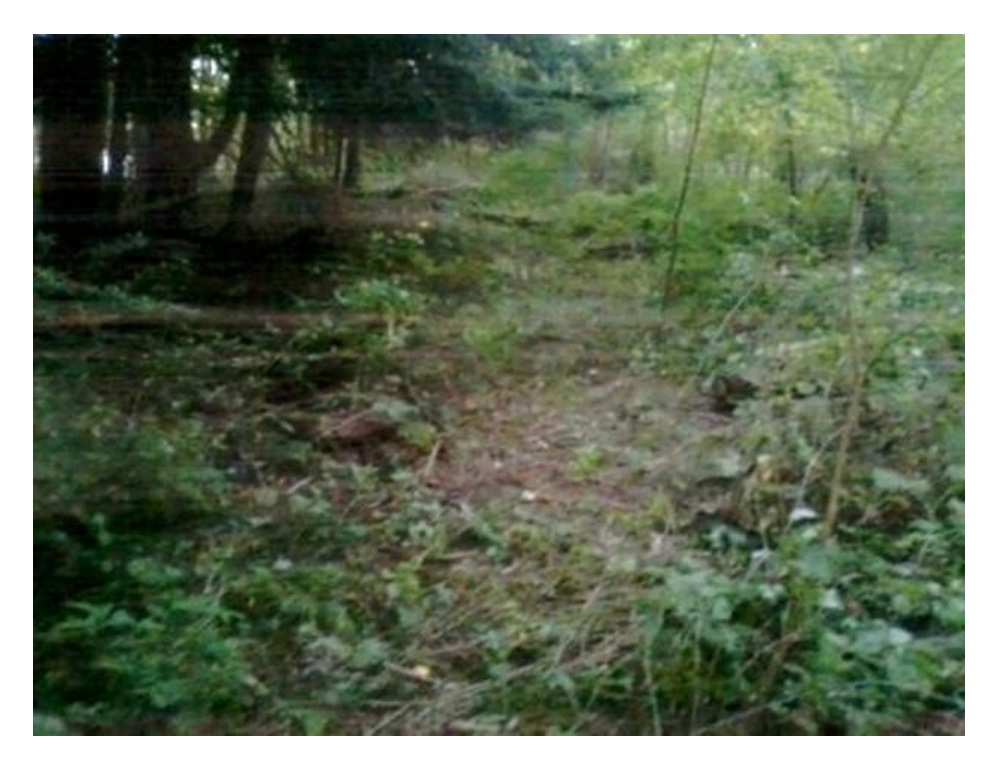
View south of the trail passing by large Eastern Hemlock trees to the left.