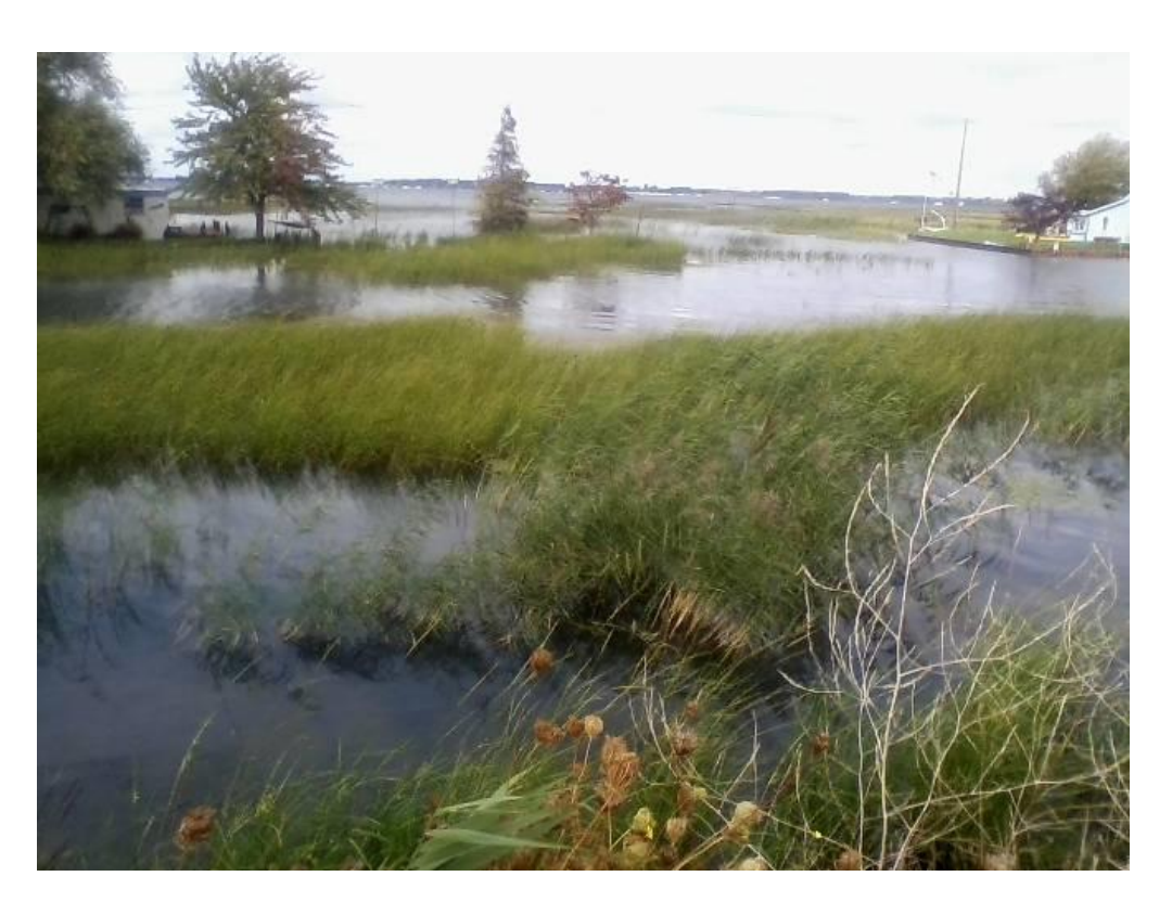
Part of a vast expanse of wild-rice along the south side of Little Muscamoot Bay.