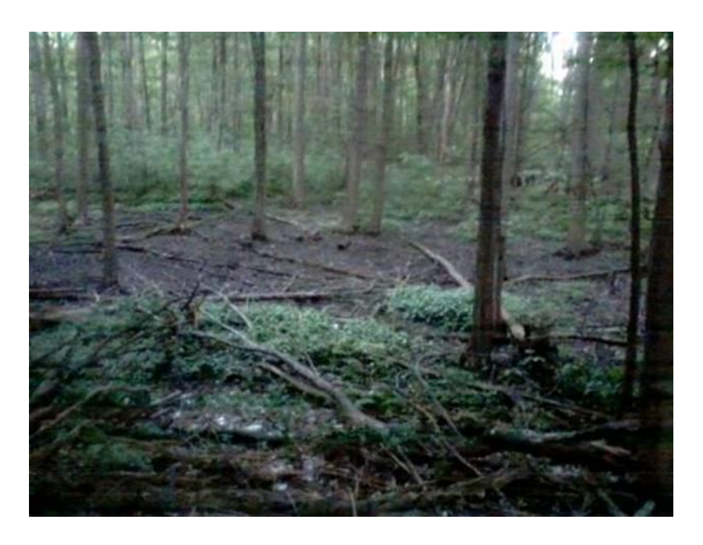
View east of the big wetland swale from the adjoining beach ridge.